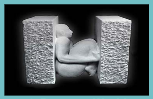
4. Between Worlds