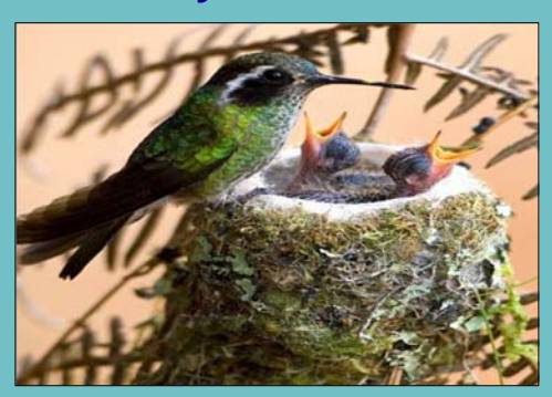
6. Learned Behavior