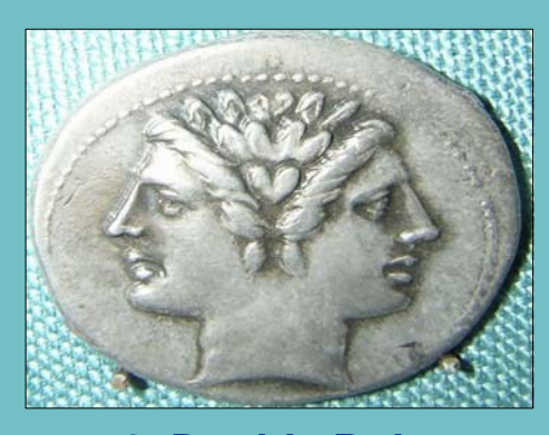
2. Double Role