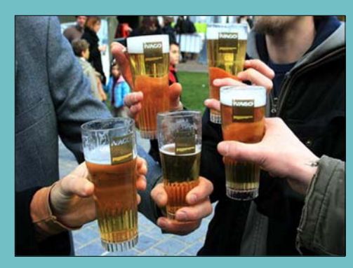
5. My New Self